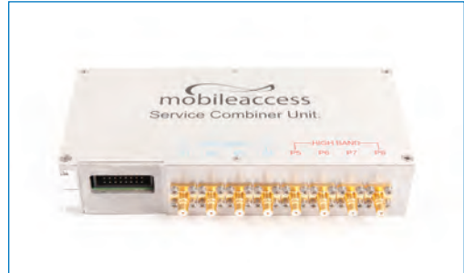
4-Port Service Combiner Unit (SCU-4) | Figure 6

Physical Characteristics • Dimensions (H x W x D): mm (in) 35 x 166 x 80 (1.38 x 6.5 x 3.15) • Mounting: Comes with bracket that allows it to be mounted directly on top of a MA2000 TSX; Optionally, can be mounted on to a TSX AMU bracket. * If being mounted to QSX, an additional bracket must be ordered.