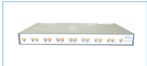
8-Port Service Combiner Unit (SCU-8) | Figure 7

Physical Characteristics • Dimensions (H x W x D): mm (in) 44 x 433 x 270 (1.7 x 17 x 10.6) • Weight: kg (lbs) 3 (6.6) • Mounting: Comes with brackets that allow it to be mounted on 19-in rack, as well as on the wall